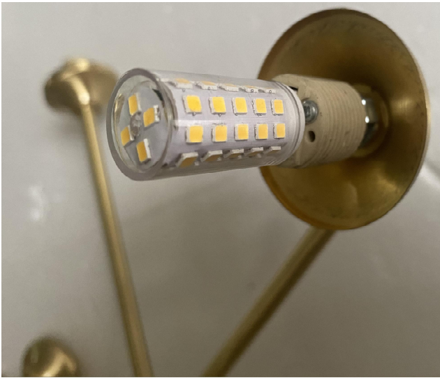
Step 7: install the bulb.