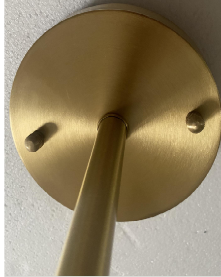
Step 6: Install the hanging plate and chassis as shown.