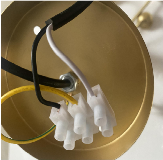
Step 5: Connect the cables as shown.