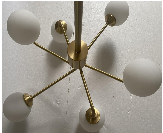
Step 8: Install the lampshade.