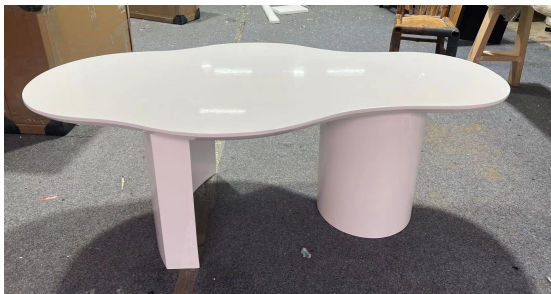
Step 4: Installed, as shown in picture 5.