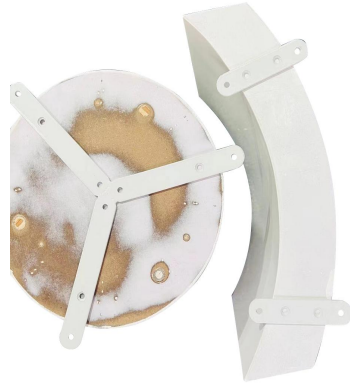
Step 1: Fasten the iron plate and the foot with screws, as shown in picture 2.