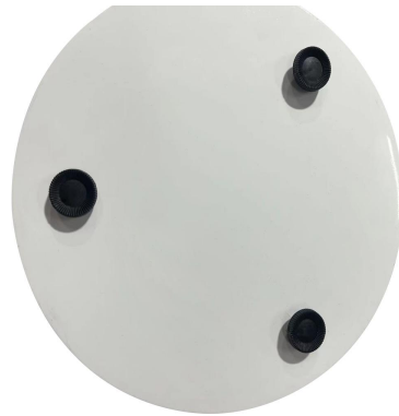
Step 3: Install the adjustment foot pads, as shown in picture 4.