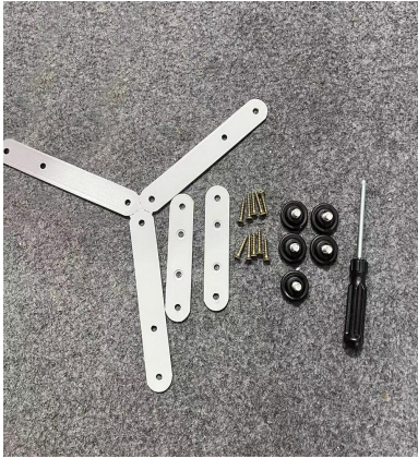
Parts List, as shown in picture 1.