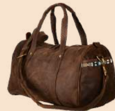
LEATHER DUFFEL (MOCHA) £550