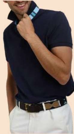
NAVY POLO £69