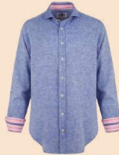
MIDA BLUE £120