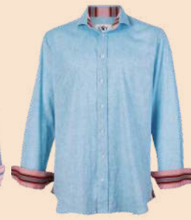
SKY BLUE £120