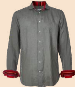
SAFARI KHAKI £120