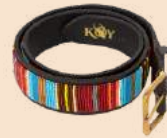
MOTO (FIRE) BELT