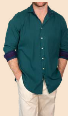
RACING-GREEN KIKOY SHIRT £120