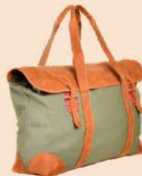
WEEKENDER (GREEN) £420