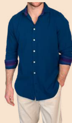
TEAL-BLUE KIKOY SHIRT £120