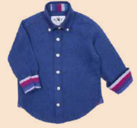
NAVY BLUE £65