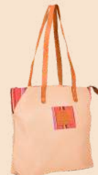
TOTE (TAN) £95