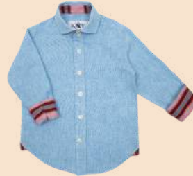
SKY BLUE £65