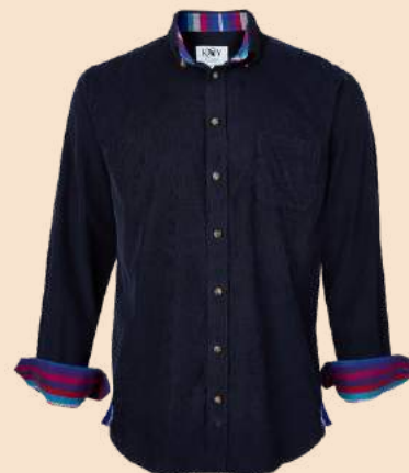
DARK NAVY £120