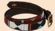
MWEZI (MOON) BELT