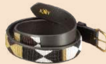
DUNIA (EARTH) BELT