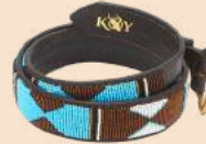
MWEZI (MOON) BELT