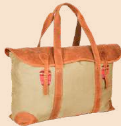
WEEKENDER (TAN) £420