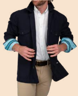
NAVY LINEN £159