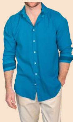
BLUE KIKOY SHIRT £120