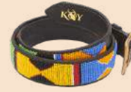
JUA (SUN) BELT