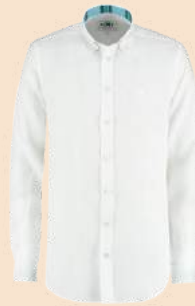
CLASSIC WHITE £120