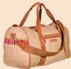
EXPLORER DUFFEL (TAN) £450