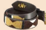
DUNIA (EARTH) BELT