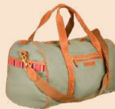
EXPLORER DUFFEL (GREEN) £450