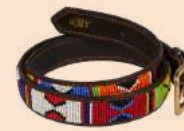
JUA (SUN) BELT