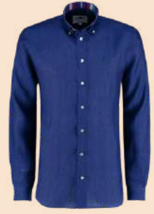
NAVY BLUE £120