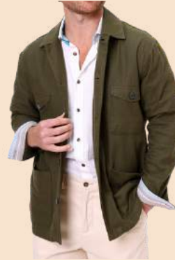
OLIVE COTTON £149