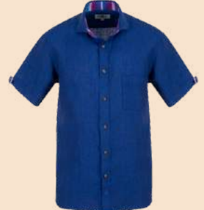
NAVY BLUE £99