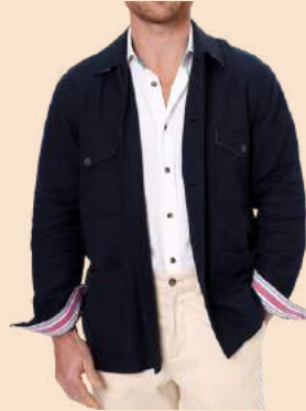
NAVY COTTON £149