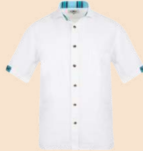
CLASSIC WHITE £99