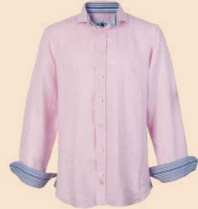
FLAMINGO PINK £120