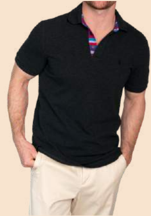
CHARCOAL POLO £69