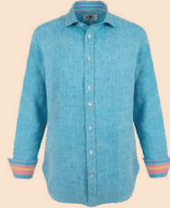
TURQUOISE BLUE £120