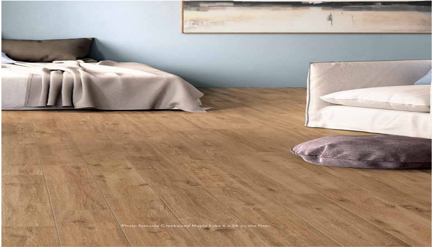
Photo features Creekwood Maple Lake 6 x 36 on the floor.