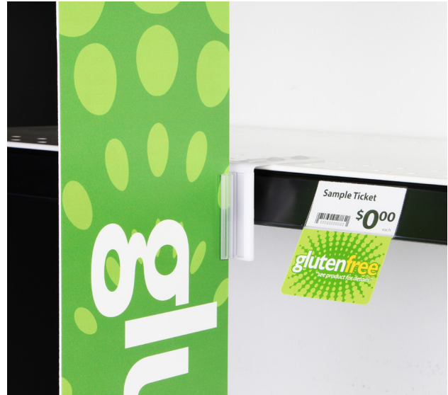
Combine large signs with smaller ShelfTalkers™