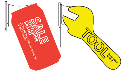
Custom right angle flag shapes - focuses attention to specific products or areas while extending a brand