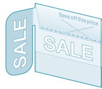
Right Angle Flag w/ Ticket Holder