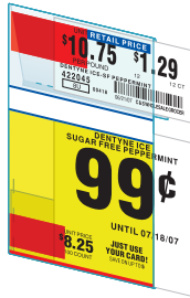
Ticket holder with 2 price tickets