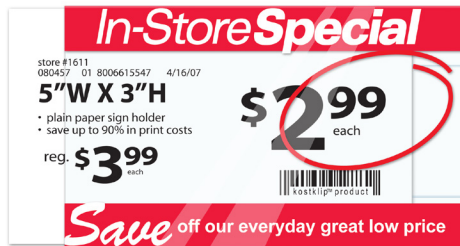
Sign Holder - slide-in low cost plain paper insert