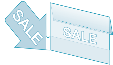
Right Angle Arrow Flag w/ Ticket Holder