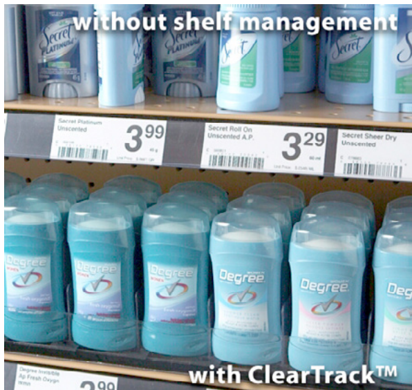
Shown: top shelf products without ClearTrack™ are jumbled, price tickets are not aligned, an uncertain inventory level