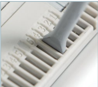
NUMBERED DIVIDER INSERTS