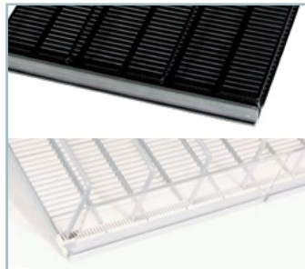
AVAILABLE IN BLACK OR BEIGE