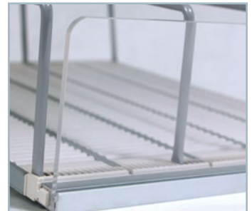
CLEAR FRONT FENCE AVAILABLE IN VARIETY OF SIZES