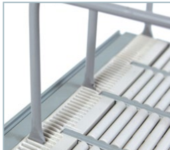
EASY TO INSTALL WIRE DIVIDERS