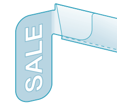
Right Angle Flag