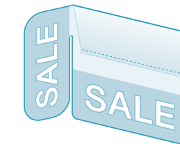
Bib with Right Angle Flag