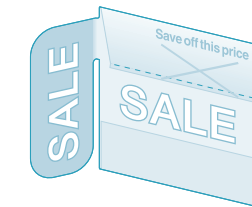
Double Ticket Holder with Right Angle Flag