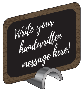
ChalkTalker™ Deli Sign installed in a Half Round Tag Holder (CHRS)