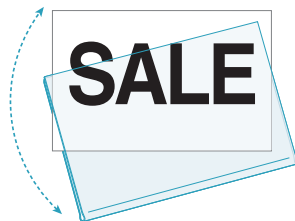
One-Fold Sign Protector 260F-104921