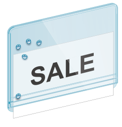
Fluid Resistant Zip Pouch FRVP-107399