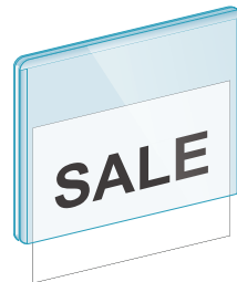
Three Side Sealed Sign Protector SPRO-104545