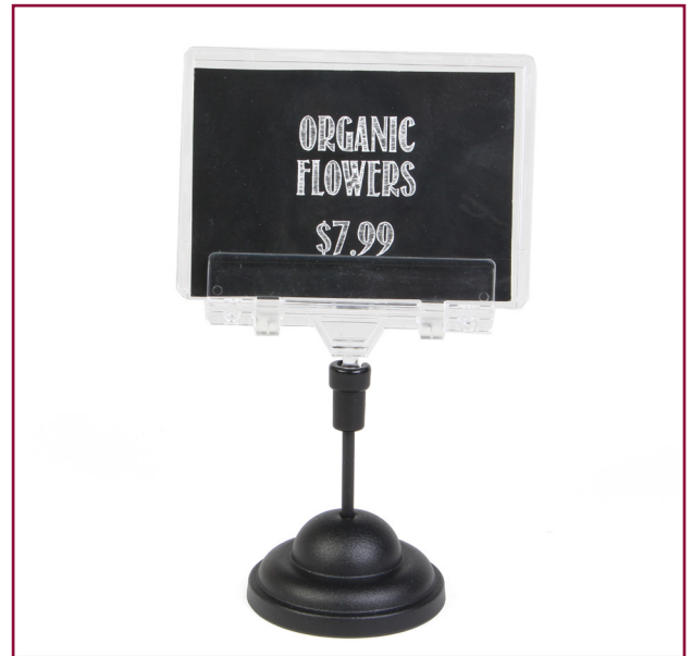
125E paired with SPRO - Three Side Sealed Sign Protector