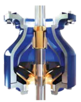
Standard cast iron bowl construction provides maximum wear resistance and reduced friction.