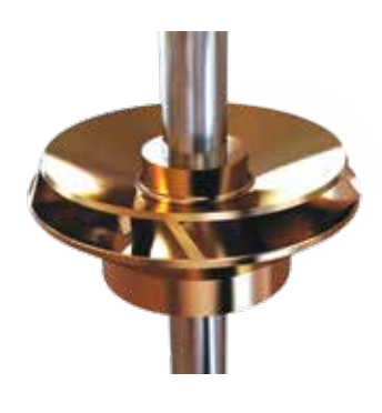
Enclosed impeller design maintains high efficiency and eliminates critical field adjustments required with semi-open or open impeller construction.