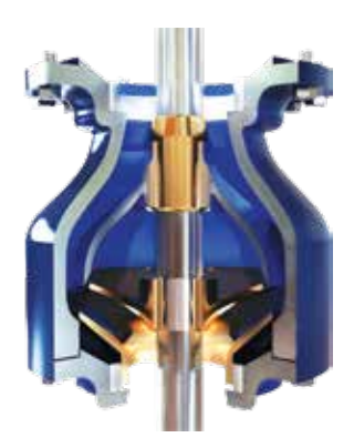
Optional construction features include bowl and impeller wear rings for extended impeller life. Keyed impellers for ease of disassembly and thrust balancing to put less strain on the driver assembly.

-Images for illustration purposes not actual construction.