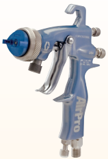
AirPro™ Conventional Gun