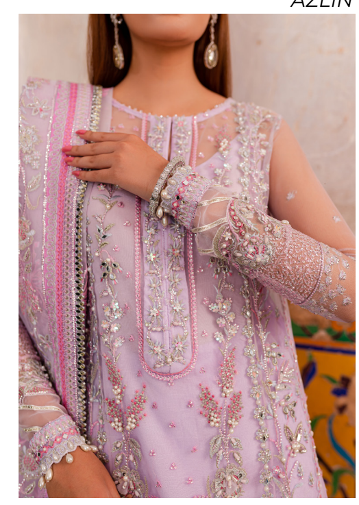
Crafted On A Lilac Canvas With Accents Of Pastel Tones, Azlin Features A Hand Embellished Long Jacket With Intricate Patterns Of Embroidery Adorned With Crytals And Creamy Pearls. It Comes With Heavily Embroidered Graceful Organza Dupatta And Same Toned Rawsilk Undershirt And Azaar, Giving Out A Divine Outlook.