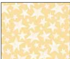
SSLO 5196 Y