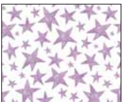
SSLO 5196 WC