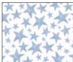
SSLO 5196 WB