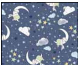
SSLO 5194 DB*†