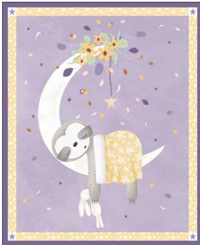
SSLO 5193 PA-C