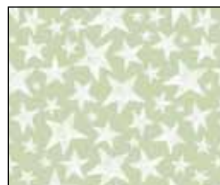
SSLO 5196 G*