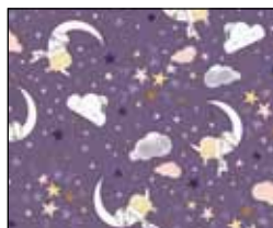
SSLO 5194 CC