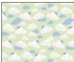
SSLO 5195 G*