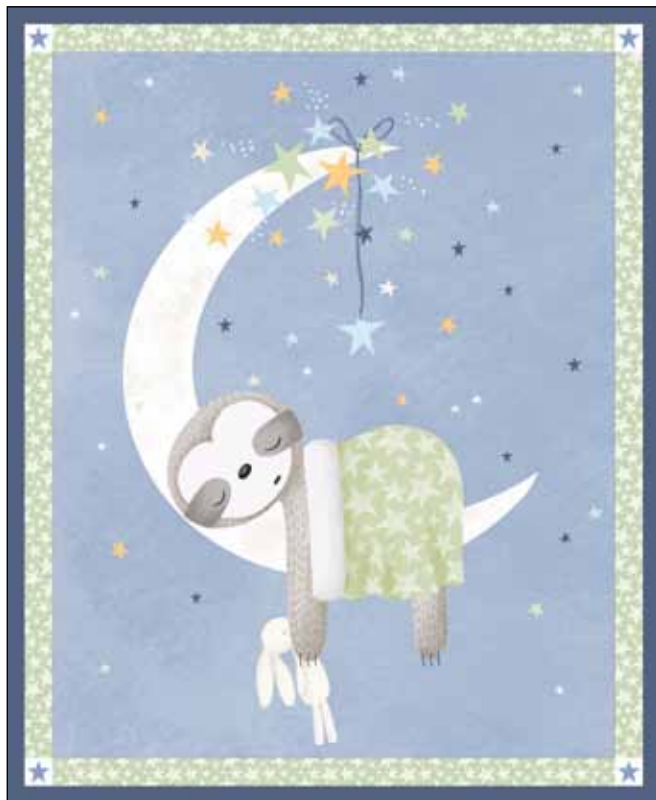
SSLO 5193 PA-B*