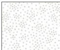
SSLO 5197 WG