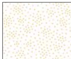
SSLO 5197 WY