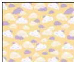
SSLO 5195 Y