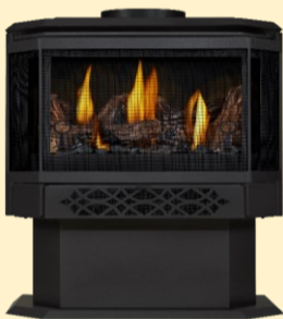
TDS28N Direct Vent Gas Stove

If you have limited space but still desire the beauty and convenience of a gas stove... The TDS28N is the answer! Offering many options and a variable heat range as high as 30,000 BTU's, this stove may be compact in stature, but not in power!