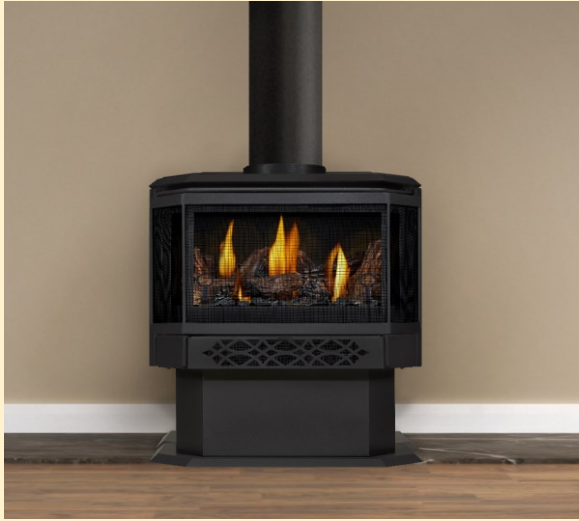
TDS28N Direct Vent Gas Stove