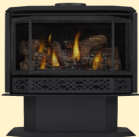
TDS50N Direct Vent Gas Stove

This sophisticated gas stove comes complete with a built-in blower, extra large heat exchanger, easily accessible control panel and an advanced high tech, triple burner