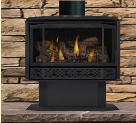
TDS50N Direct Vent Gas Stove