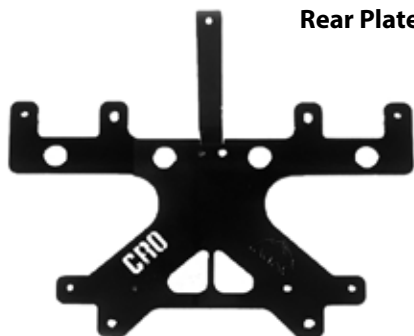
Illustration #1 Rear Plate