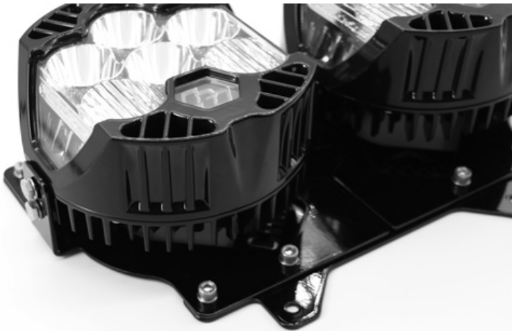
Showing LP6 Mounting Plates attached to Rear plate with Socket Heads