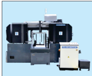
Highly Cost Effective Automatic Bandsaw Based on LMG Guides

Pioneer in India for design and manufacturing of Metal Sawing Band Saw and Circular Saw Machines.