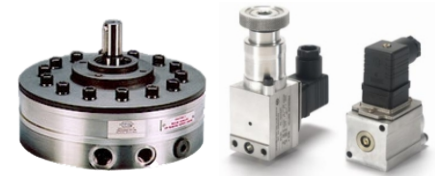
Radial Piston Pump Pressure Switch

POLYHYDRON offers excellent quality product with low cost