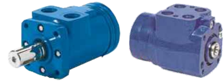
Gear Motor Steering Units

CHAR-LYNN offers wide variety of steering controls, general purpose motors including spool valves motors, Disc valves motors and other high-performance motors