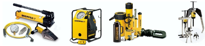
Hand Pump Electric Pump Jacks & Cylinders Pullers

ENERPAC is a manufacturer of high-force tools and components for a variety of markets and applications. Products range includes