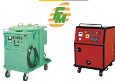
ELC 50 C LVDH

FERROCARE Manufactures world class filtration machines