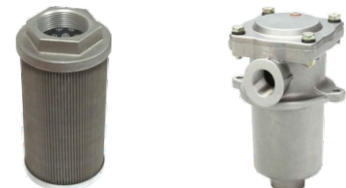
Suction Strainer Return Line Filter