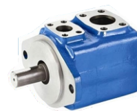
Single Vane Pump