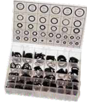
'O' Ring Kit

AEROQUIP offers hose, fittings, adapters, couplings and fluid connectors for all pressures in industrial, aerospace and automotive applications.