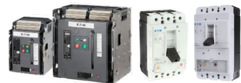
Air Circuit Breaker & MCCB