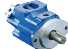
Double Vane Pump

• Aluminum body • Compact design • Flow- 5cc to 24cc • Pressure upto 205 bar • Low noise • Speed upto 1800RPM • Max flow: 240LPM for single pump • Max flow: 240+175LPM for double pump • Single Pump Series: V110, V210, 25V, 35V • Double Pump Series: 2520V, 3520V, 4520V • Max press: 205 bar