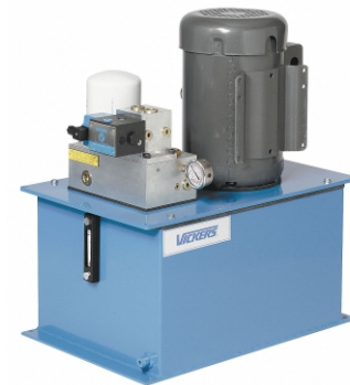
Hydraulic Power Packs

DANFOSS (EATON) offers all types of Hydraulic Cylinders ranging from • Bore sizes : 40 to 320mm • Rod sizes : 25 to 220mm • Design Pressure : 25Mps (250 bar) • Proof Pressure : 37.5 Mpa (375 bar) • Maximum Rod Speed : 1.0 m/s.