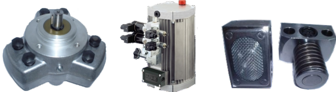
Radial Piston Pump Pumping Unit Pump Spares

HAWE is the biggest name for high pressure hydraulic cement industries. Hawe radial pumps are specially designed for