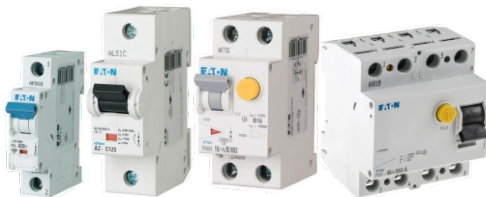
Final Low Voltage Product Range