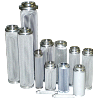
Filter Elements Duplex Pressure Filter