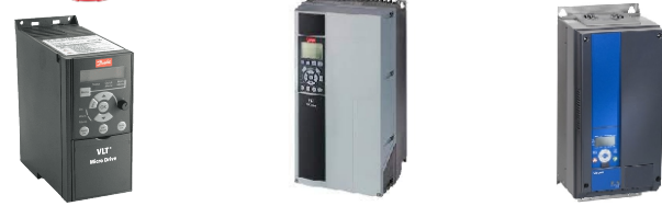
VLT@ Micro Drive VLT@ Automation Drive VACON@ 20