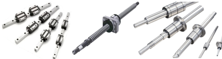
LM Guide & Rail