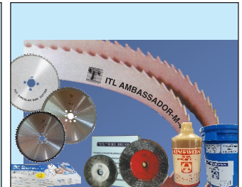
Bi Metallic Band saw Blades, TCT/Cermet and HSS Circular Saw Cutters, Micro Mist Oil