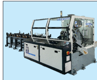
High Speed NC Carbide Circular Saw with AC Servo Drive and Auto Loader