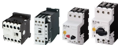
Contractors & overload Relays, MPCB