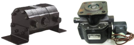
Flow Divider Gear Pump

CONCENTRIC provides some of the world's best hydraulic products of unmatched quality consisting of Gear Pumps & Flow Dividers for Cement Industry & Mobile Equipments.