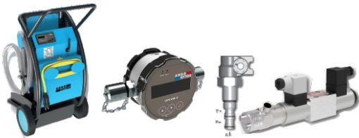
Filtration Trolley Nas Sensor Proportional valve

ARGO HYTOS provides wide range of Filtration system and Electro hydraulic Valves