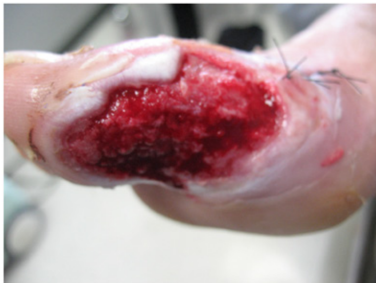
Day 1 4.2 x 3.4 x 0.2 cm