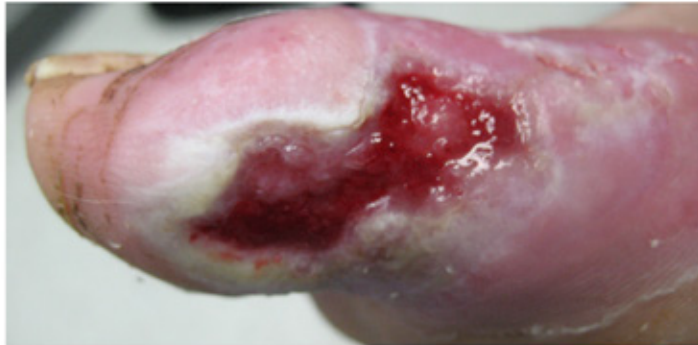
Day 8 3.5 x 2.5 x 0.15 cm