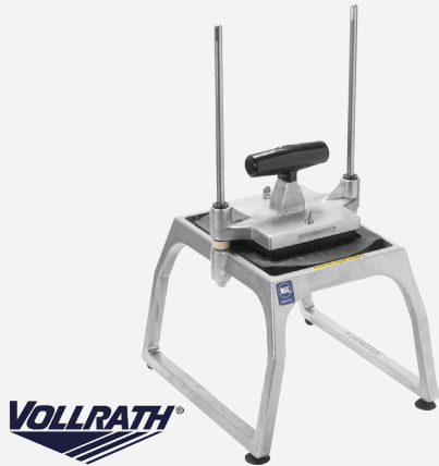
InstaCut Manual Dicer, 3/8" SKU: 23008 | MPN: 55458