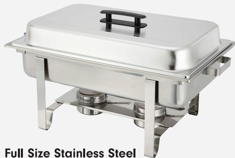
Full Size Stainless Steel Chafing Dish, 8 qt. SKU: 2198 | MPN: CEC