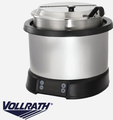
Mirage Induction Rethermalizer, 11 qt. SKU: 33785 | MPN: 74110110