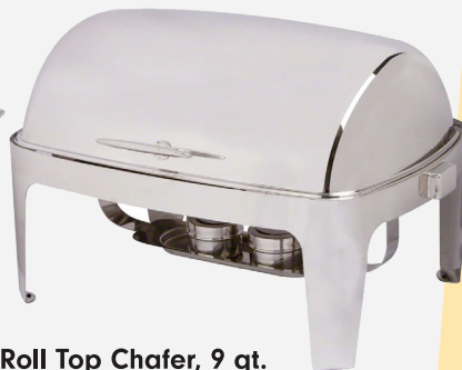
Roll Top Chafer, 9 qt. SKU: 3657 | MPN: 601