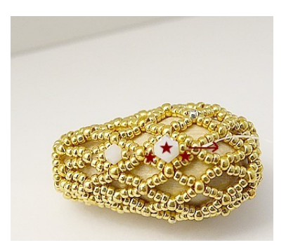
26) Pick up 1 R15, 1 T4, 1 R15, pass through following R11