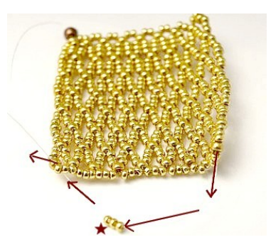
13) Zip your work. Pick up 3 R15, pass through R11 on the other side