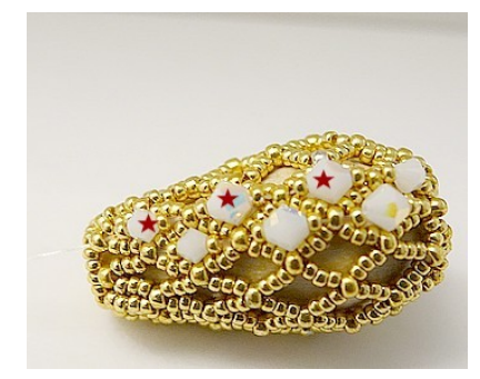
29) Repeat with 1R15-1T4-1R15 twice and 1R15-1T3-1R15