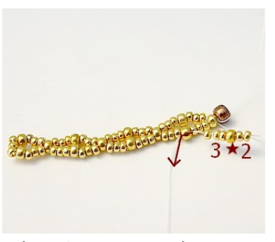
7) Pick up 2 R15*, 1 R11, 3 R15, pass through R11. (*Be careful always 2 R15 first, at the top of your work)