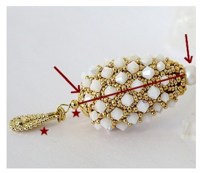
31) Place a 70mm eye pin in the wooden bead and place round beads and charms of your choice