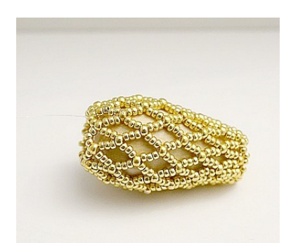
19) Place your work in your Jess wooden base. Top of your work should fit in thin part of wood