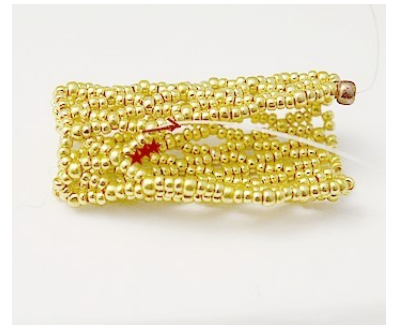
15) Repeat for the length of the pattern