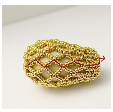
22) Pass through all seed beads and exit through 2R15, top of your work