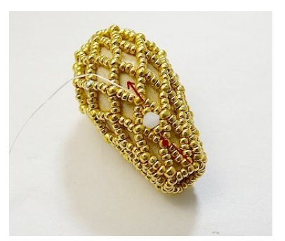
25) Pick up 1 R15, 1 T3, 1 R15, pass through following R11