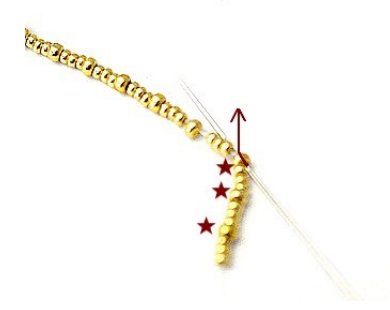
3) Exit through 3rd R11