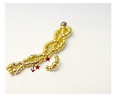
9) Pick up 3 R15, 1 R11, 3 R15, pass through 2nd R11