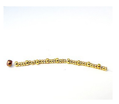
2) Pick up 1 R11 and 3 R15, for a total of 9 times