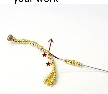
4) Pick up 3 R15, 1 R11, 3 R15, pass through 2nd R11