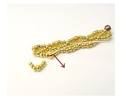
11) Pick up 3 R15, 1 R11, 3 R15, pass through next R11