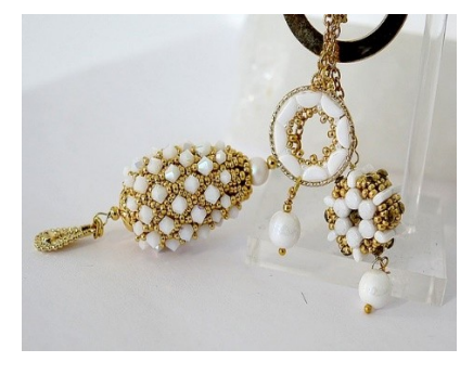
32) You can put together several beaded beads! In the picture are Victoria©, Donuts© and Léa© par Puca®!

Happy beading! Thank you for respecting my work ©