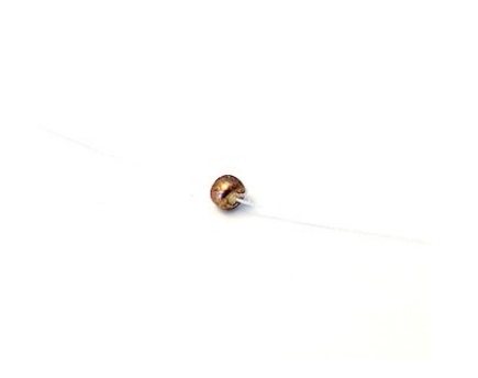
Place 1 stop bead. It will be your reference point for the top of your work