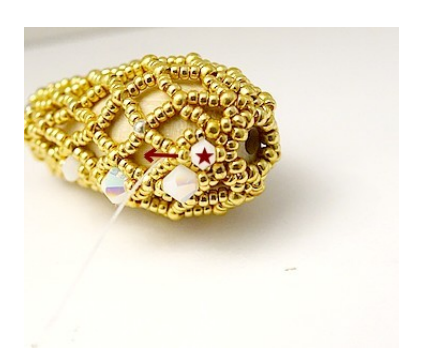
28) Pick up 1 R15, 1 T3, 1 R15, pass through following R11