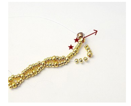
6) Pick up 3 R15, 1 R11, 3 R15, pass through final R11