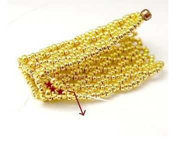
14) Pick up 3 R15, exit through opposite R11, in zigzag