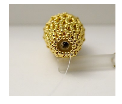
23) Pass through all R15 to tighten