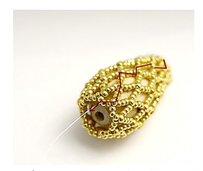
20) Pass through all seed beads and exit through central R15, bottom of your work