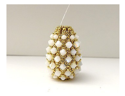
30) Repeat steps 25 to 29 for the length of the pattern. Tie off your thread