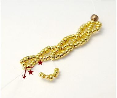
10) Pick up 3 R15, 1 R11, 3 R15, pass through 2nd R11