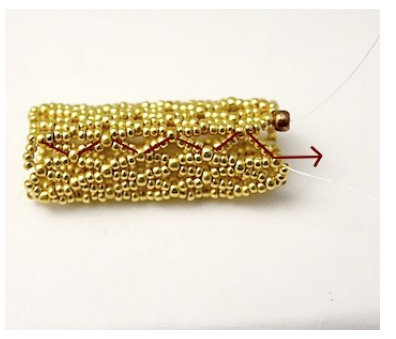
16) You'll now have this