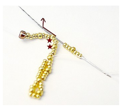
5) Pick up 3 R15, 1 R11, 3 R15, pass through 2nd R11