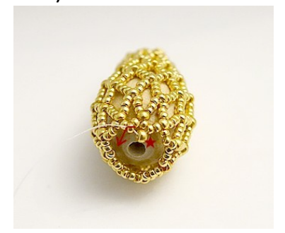
21) Pick up 1 R11 between each central R15, repeat to strengthen