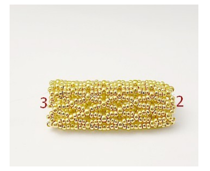
18) You'll now have this. Number 2 = top of your work, number 3 = bottom of your work (quantity of R15)