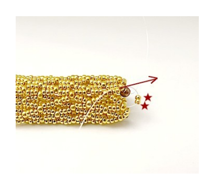
17) Pick up 2 R15, pass through R11, near stop bead. Remove stop bead