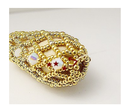
27) Pick up 1 R15, 1 T4, 1 R15, pass through following R11 and exit between R15 like picture