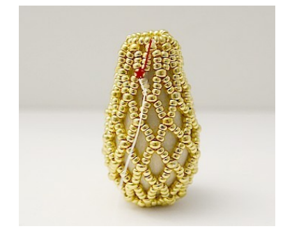
24) Exit through R11 like picture