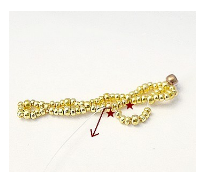
8) Pick up 3 R15, 1 R11, 3 R15, pass through 2nd R11