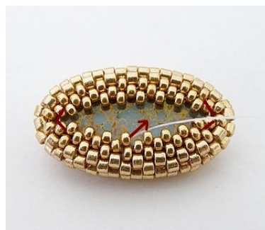
11) Repeat step 10 on the other side