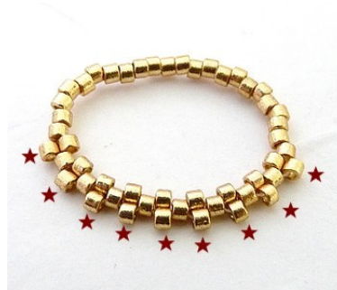
2) Bead 9 DB in Peyote