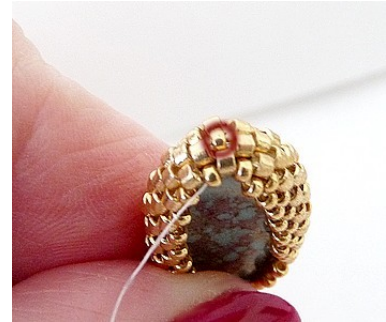
9) Be careful! Place the R15 of step 3 on the top of Athos