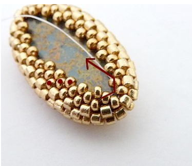
10) Bead a 3rd R15 row, but pass through the existing 2 R15 (don't add new R15)