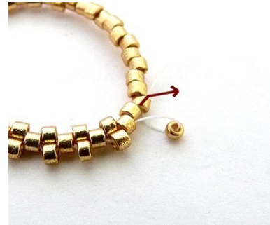
3) Pick up 1 R15