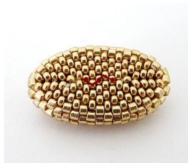
14) Pick up 3 R15 and zip the 2 sides to end