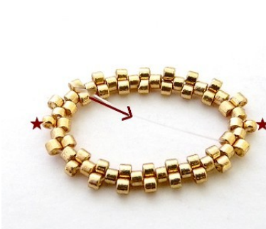
4) Pick up 9 DB, 1 R15 and exit like picture, inside the circle