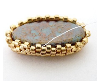
6) Turn work over, place your Athos and bead 2 DB11 rows