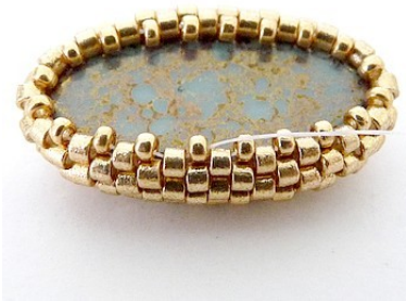
7) Bead 1 R15 row