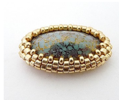
15) You'll now have this