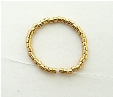
1) Pick up 40 DB and close