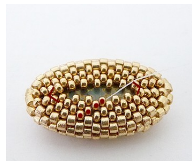
12) Bead a 4th R15 row with the same explanations of step 10