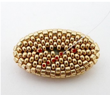
13) Bead a 5th R15 row with this time 1 R15 for each top