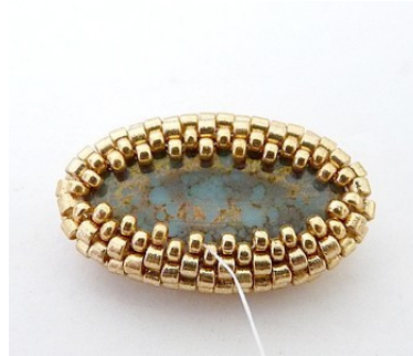
8) Bead a second R15 row, but don't bead corners