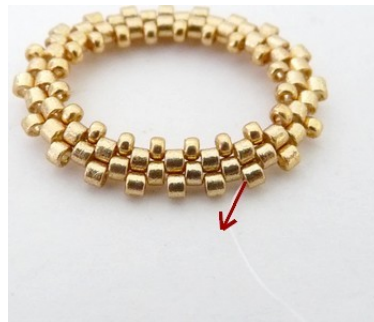
5) Bead 1 R15 row and exit like picture, out of the circle