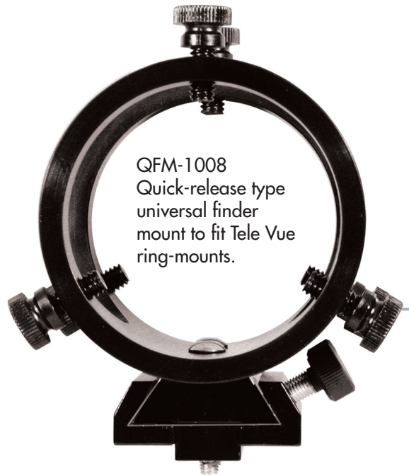
QFM-1008 Quick-release type universal finder mount to fit Tele Vue ring-mounts.