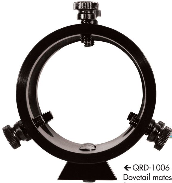
← QRD-1006 Dovetail mates with finder mount and QRB-1002

QFM-1008 Quick-Release finder Mount includes QRD-1006 Dovetail & QRB-1002 Quick-Release Bracket