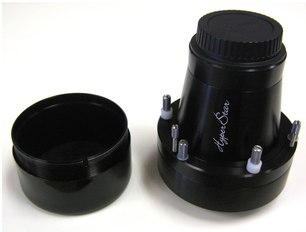
Secondary holder (shipped attached to lens) & HyperStar lens