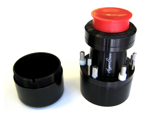
Secondary holder (ships attached to lens), & HyperStar lens