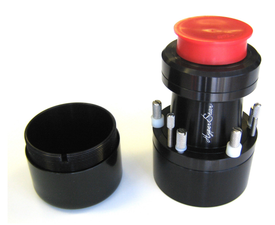
Holder capping the HyperStar