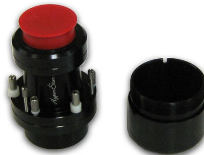
Holder removed to accept secondary mirror