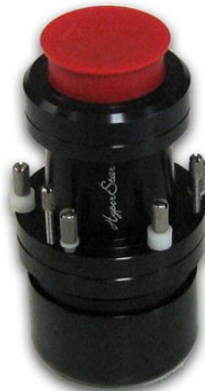
Holder capping the HyperStar