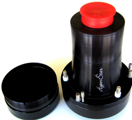
Secondary mirror holder and HyperStar lens (with camera adapter attached)