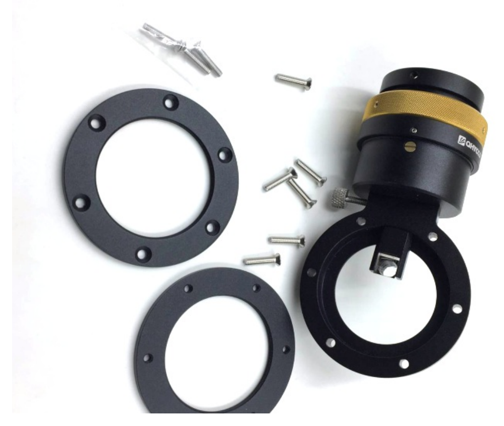
Put one piece on front of the OAG, one on back side of the OAG. Use six M3 screw to connect them. Normally speaking the one with M3 thread should be put in back side of the OAG. Now with the two piece thread adapter the total length is 16mm.