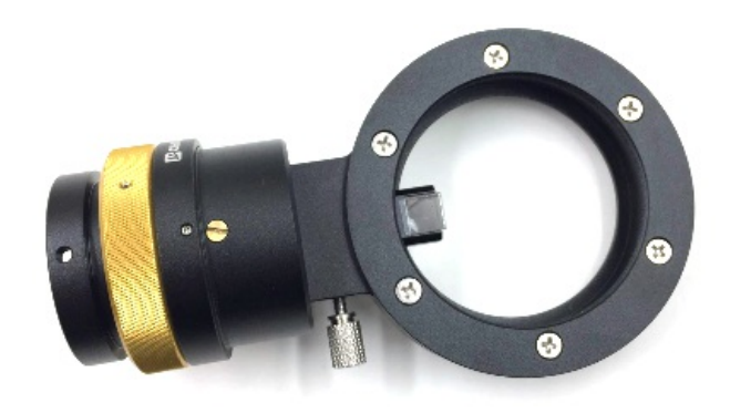
Front is M42/0.75 and back side is M54/0.75