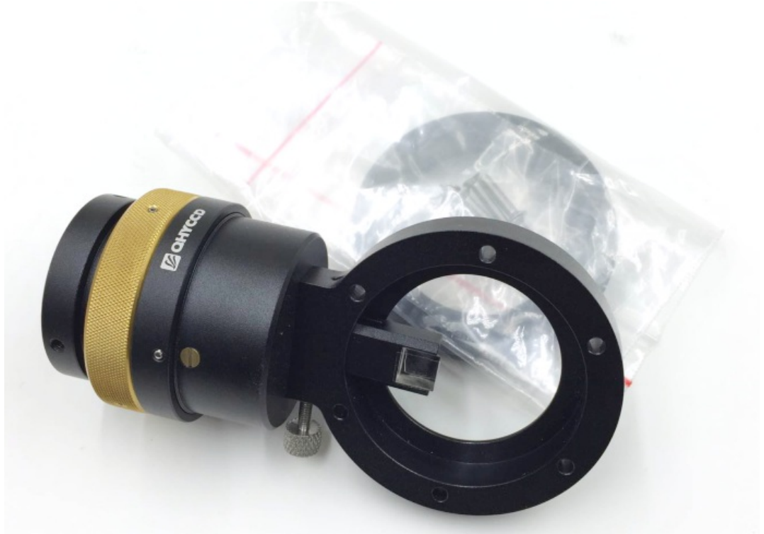
You will find a pair of M42/0.75 thread adapter and some screws in a plastic bag.