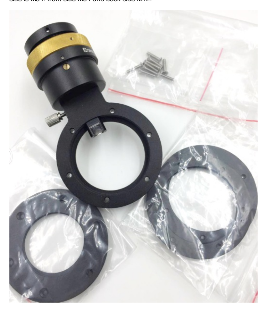
Both side is M54/0.75

It is very simialr for QHYOAG-M. You can take the step above. The only difference is QHYOAG-M support both M42/0.75 and M54/0.75 thread adapter. So there is totally four possible setup: Both side is M42/0.75, both side is M54/0.75, front is M42 and back side is M54. front side M54 and back side M42.