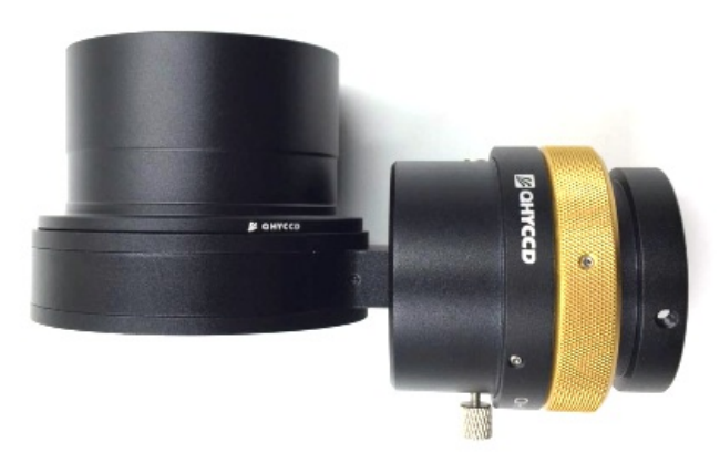
Connect with M42/0.75 to 1.25inch adapter (made by QHYCCD)