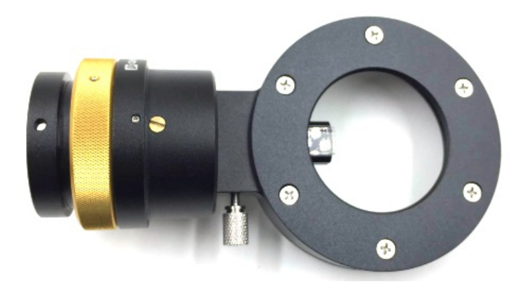
Front size is M54/0.75 and back side is M42/0.75