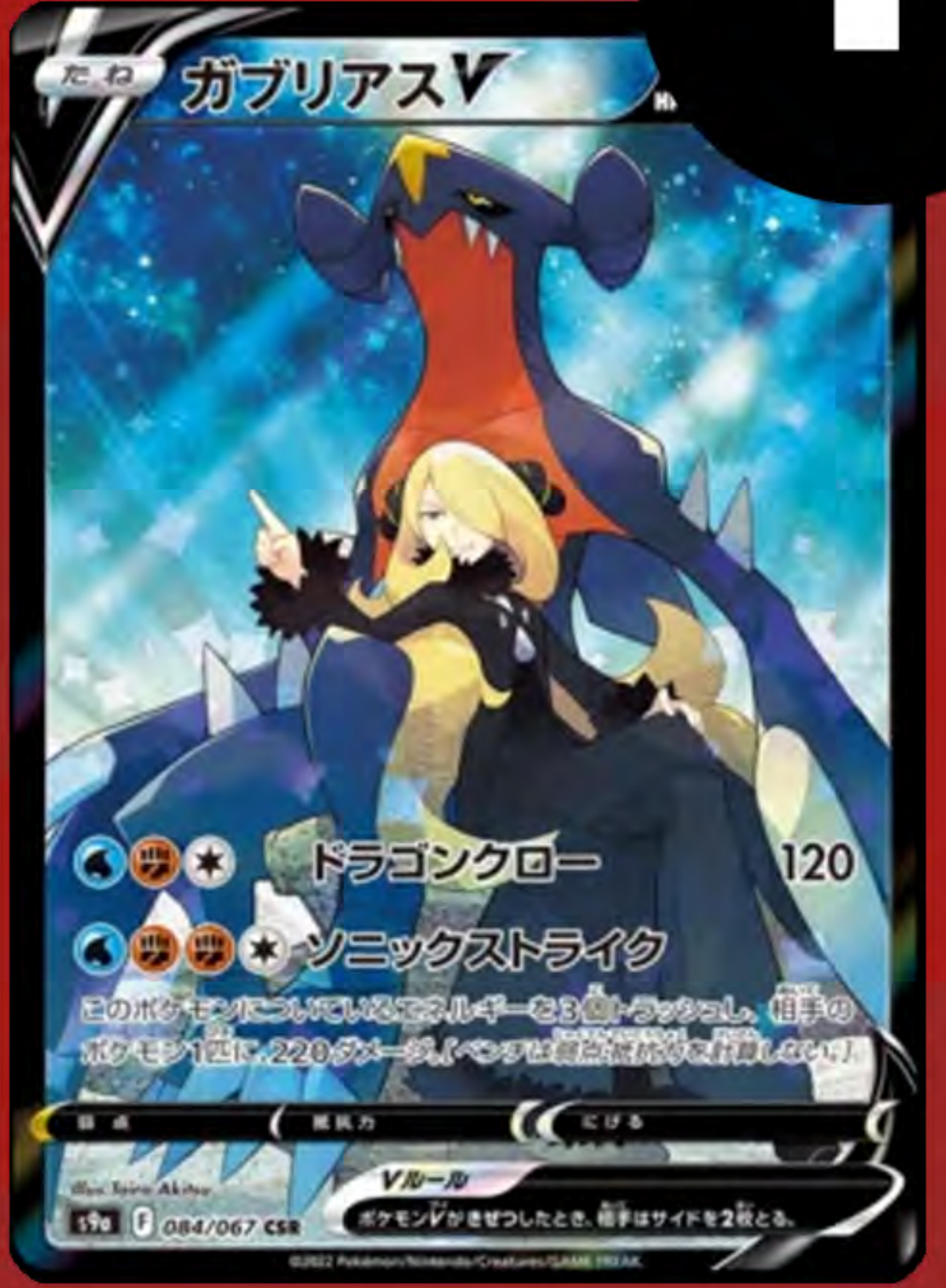
Garchomp V #84