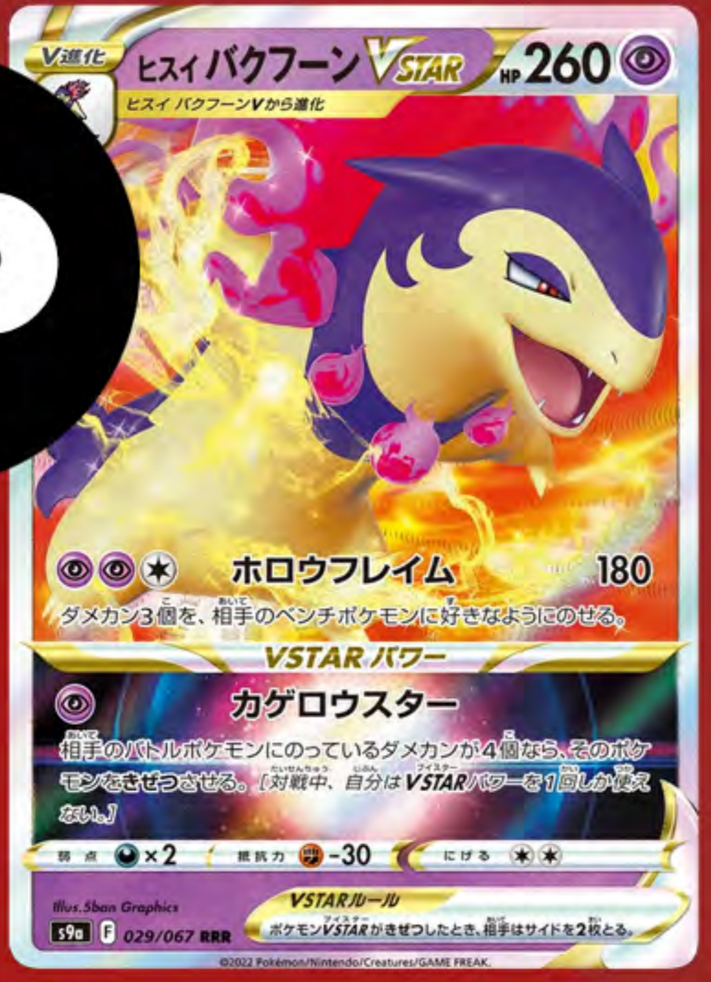
Hisuian Typhlosion VSTAR #29