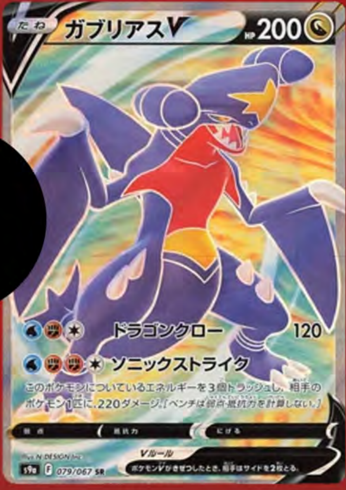
Garchomp V #79