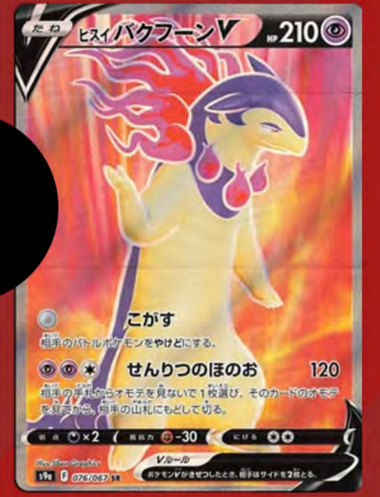
Hisuian Typhlosion V #76