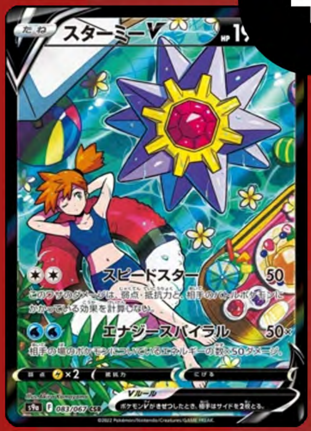
Starmie V #83