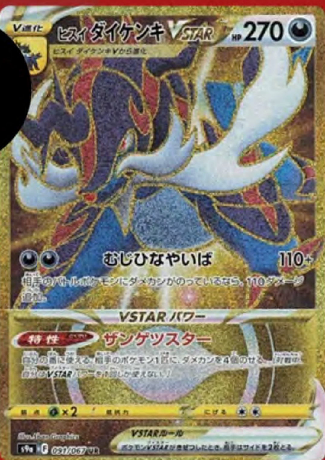
Hisuian Samurott VSTAR #91