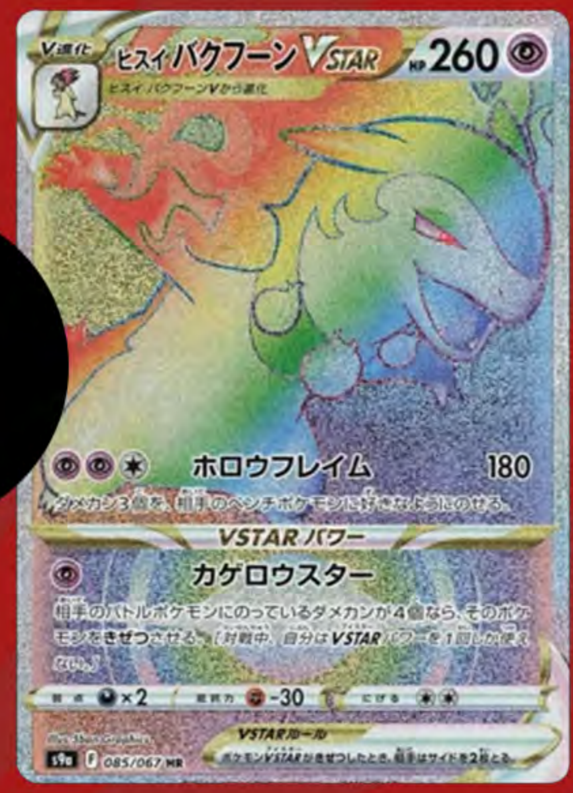
Hisuian Typhlosion VSTAR #85