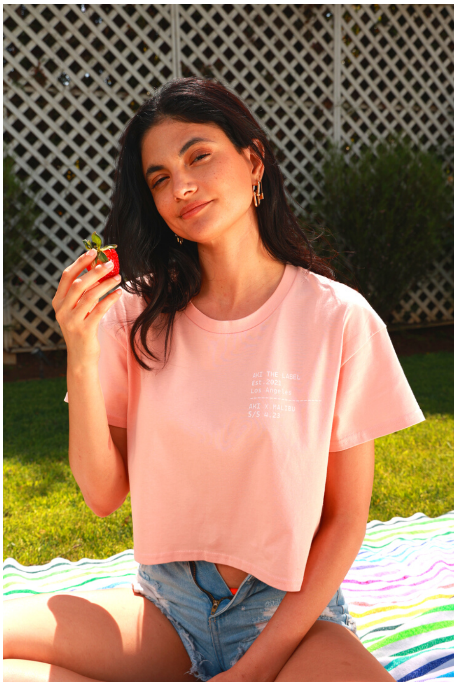
LAINÉ TEE - MALIBU COLLECTION