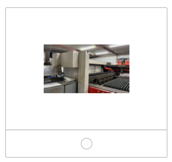
Machine images in different angles