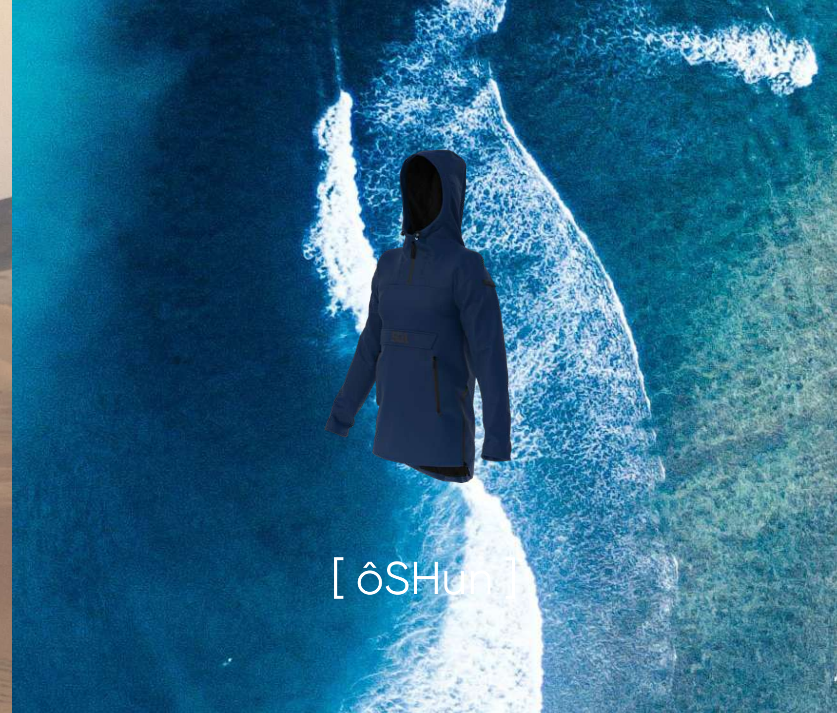
[ ôSHUN ]