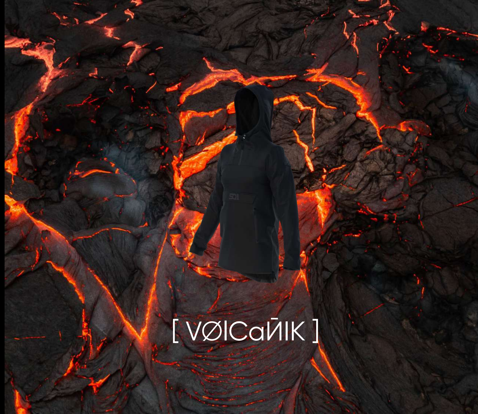
[ VØICaЙIK ]

Blurring the lines between skiwear, streetwear and sportswear.