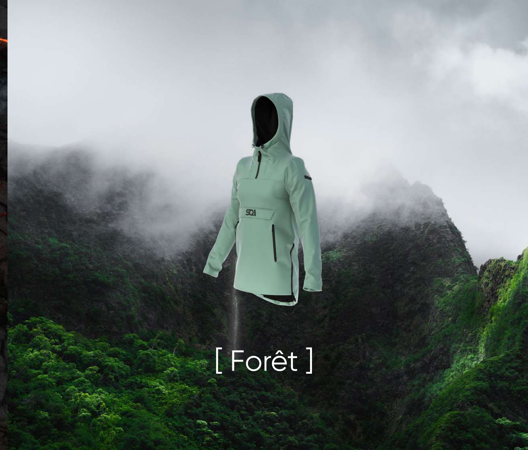
[ Forêt ]