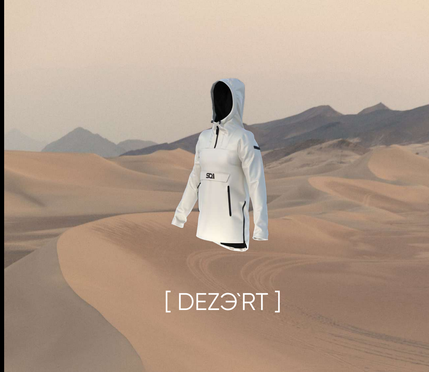
[ DEZƏ'RT ]