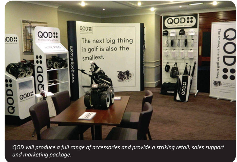
QOD will produce a full range of accessories and provide a striking retail, sales support and marketing package.