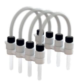
Vapor Diffusion set-up

Professor at Zurich University, Switzerland