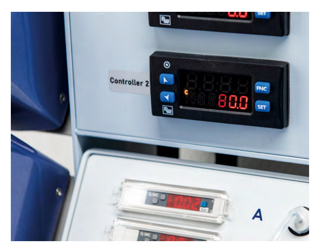
Close up controlled evaporation and vapor diffusion set ups

The two modules sit on top of the CrystalBreeder , maintaining a compact footprint. Users control the temperature, heat/cool rate, stirring speed and evaporation pressure for all disposable block reactors with the software, generating accurate solubility and crystallization data in a short time.