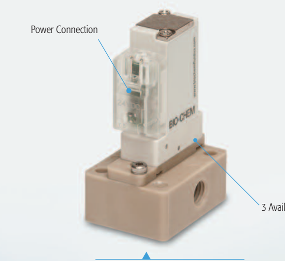
Opus Rocker Valve -Shown with PEEK Materia

Reliability is critical. The Opus rocker valve, like all Bio-Chem valves, is tested under typical real life usage, not idealized situations only imagined in test engineering environments. With a mean time to failure of 15 million cycles, Opus displays exceptional durability, making it perhaps the most dependable rocker valve on the market today.