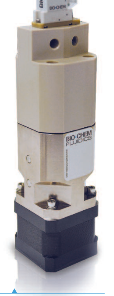
Maestro ULTRA with PEEK Head Shown with Mounted Opus Rocker Valve

The Opus compact 10mm footprint yields a significant additional benefit: reduced internal fluid volume and dead fluid 'carryover' volume. Opus makes great strides toward the ultimate goal of 'zero dead volume,' helping to substantially reduce both consumption of expensive reagents as well as additional costs and lost productivity associated with maintenance and cleanings - improving overall efficiency and profitability.