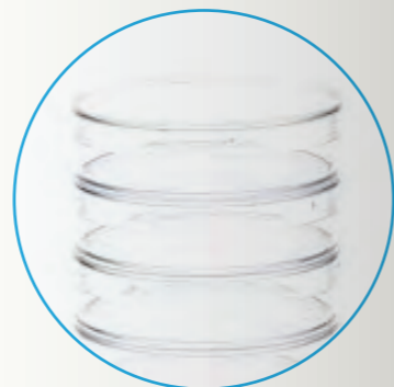
Stackable for easy storage