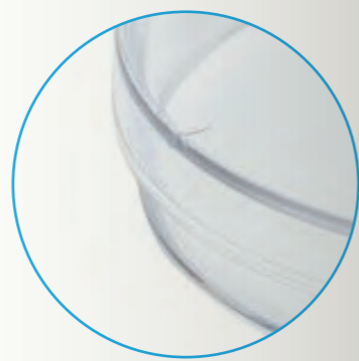
Triple vents aids gaseous exchange