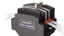
DG15-24 DG15-28 DG15-48