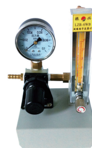
NDK-GV Gas Control Valve