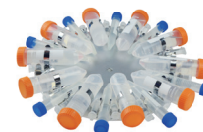
YC-E platform: 50ml centrifuge tubeX10 15ml centrifuge tubeX10 1.5ml centrifuge tubeX30