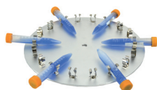
YC-B platform: Conical tube 15mlX18