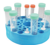
YC-D Foam tube holder: 50ml centrifuge tubeX12 15ml centrifuge tubeX12 1.5ml centrifuge tubeX30