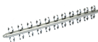
VM80-B Tube Holder Frame: 15ml Sharp Bottom Tube x 22