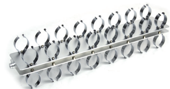
VM80-C Tube Holder Frame: 50ml Sharp Bottom Tube x 16