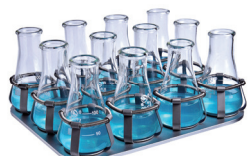
Flask Platform P12-100