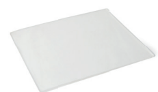
Sticky Pad SPD-GS used in the platform PP-4 or PP-4A