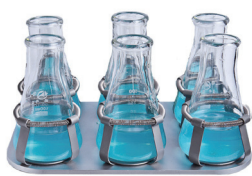
Flask Platform P6-250