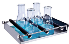
Adjustable Bar Platform UP-12