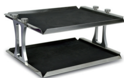
Double Deck Platform PP-4A