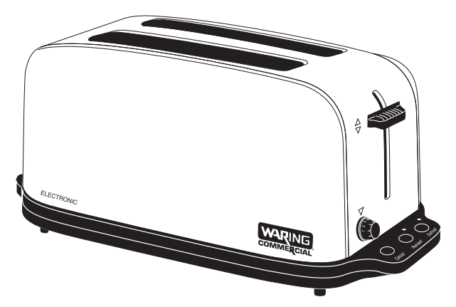
WCT704 - 4-Slice Electronic Toaster

For your safety and continued enjoyment of this product, always read the instruction book carefully before using.