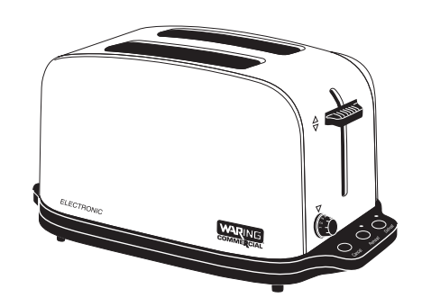
WCT702 - 2-Slice Electronic Toaster