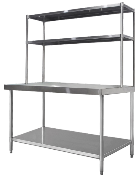
Double Overshelf (MROS-4RE, MROS-5RE, MROS-6RE)