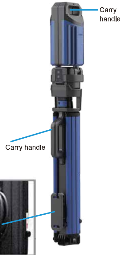
Built-in cable and charger wrapping system for tidy storage.