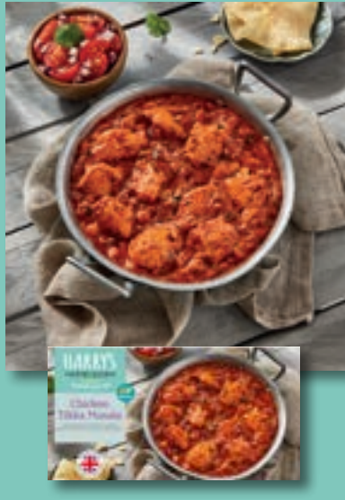
Chicken Tikka Masala 375g