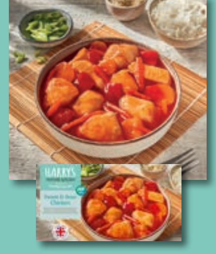
Sweet & Sour Chicken 375g