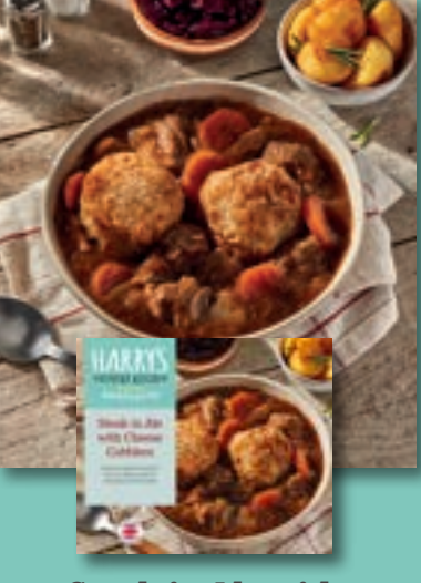
Steak in Ale with Cheese Cobblers 400g