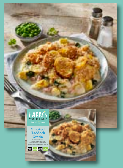
Smoked Haddock Grafin 350g