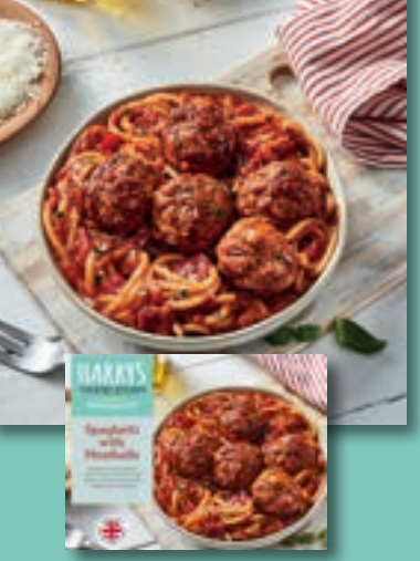
Spaghetti with Meatballs 400 q