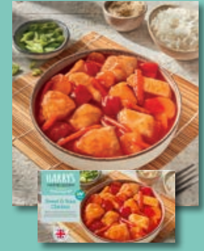
CHINESE Single Serve Meals