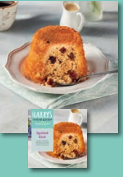
Spotted Dick 170g