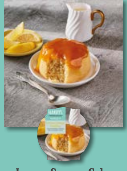
Lemon Sponge Cake 100g