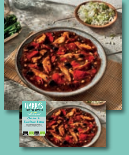
Beef in Blackbean Sauce 375g