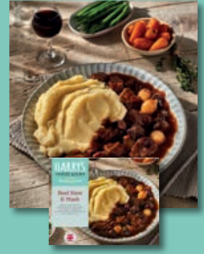
TRADITIONAL Single Serve Meals