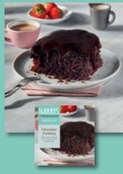
Chocolate Pudding 185g