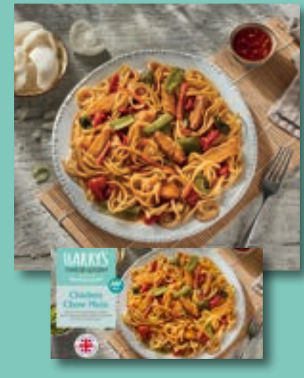
Chicken Chow Mein 375g