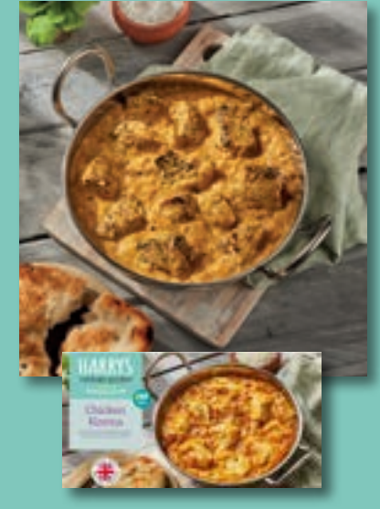
Chicken Korma 375g