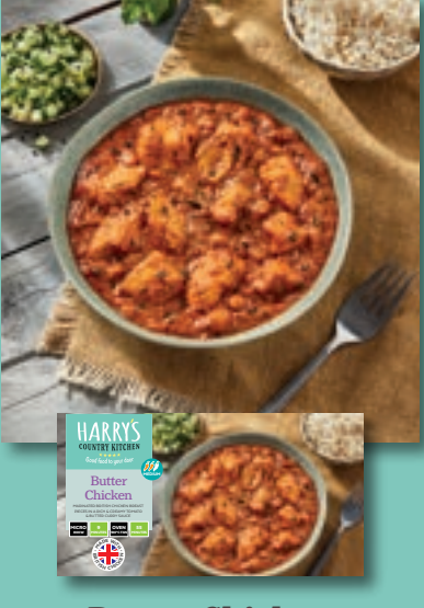
Butter Chicken 375g