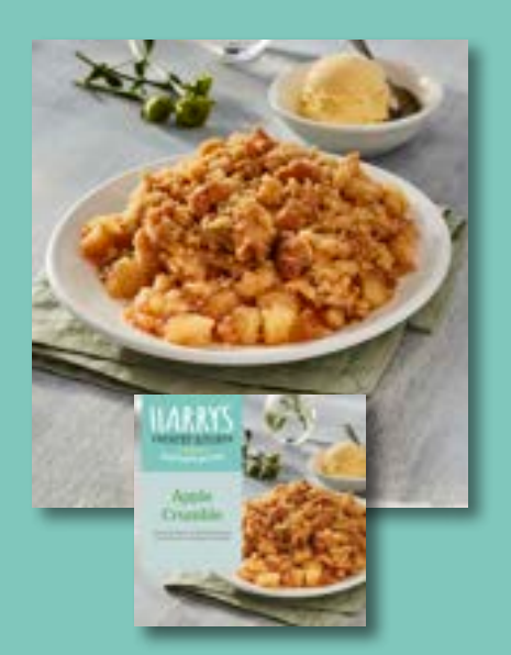
Apple Crumble 250g