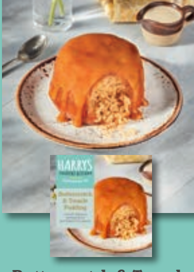
Butterscotch & Treacle Pudding 185g