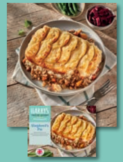
Shepherd's Pie 400g