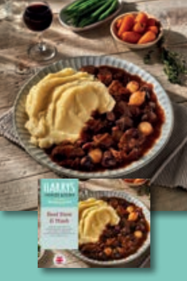
Beef Stew & Mash 400g