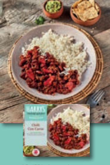
Chilli Con Carne 400g