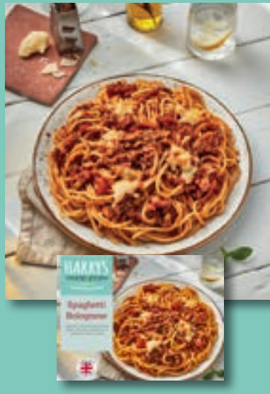
Spaghetti Bolognese 400 g