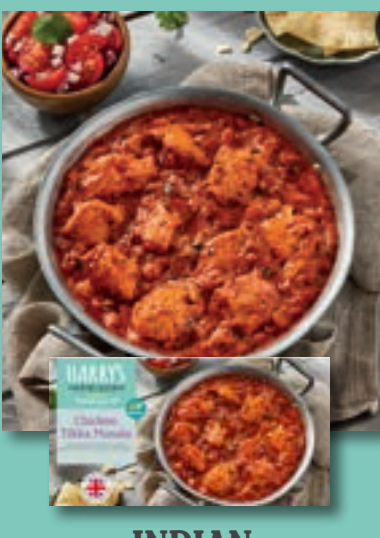
INDIAN Single Serve Meals