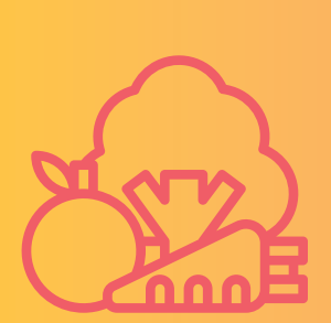
Eat a healthy, balanced diet