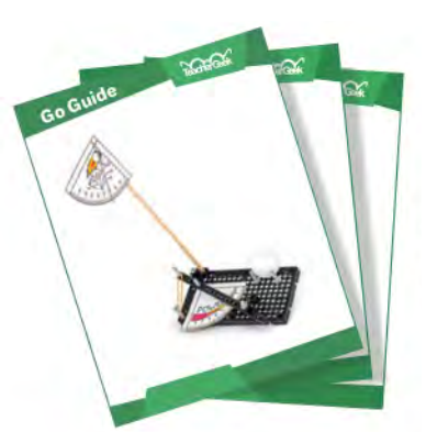
Lab Answer Key Passwords "Catch the Bug": B18-CH39 Other Passwords: Pascal7

Think your build is the best? Prove it! Our challenges are sure to stir up some friendly competition and have you racing to improve your design in order to be the very best. Some challenges even feature exciting scenarios that'll get everyone fired up!