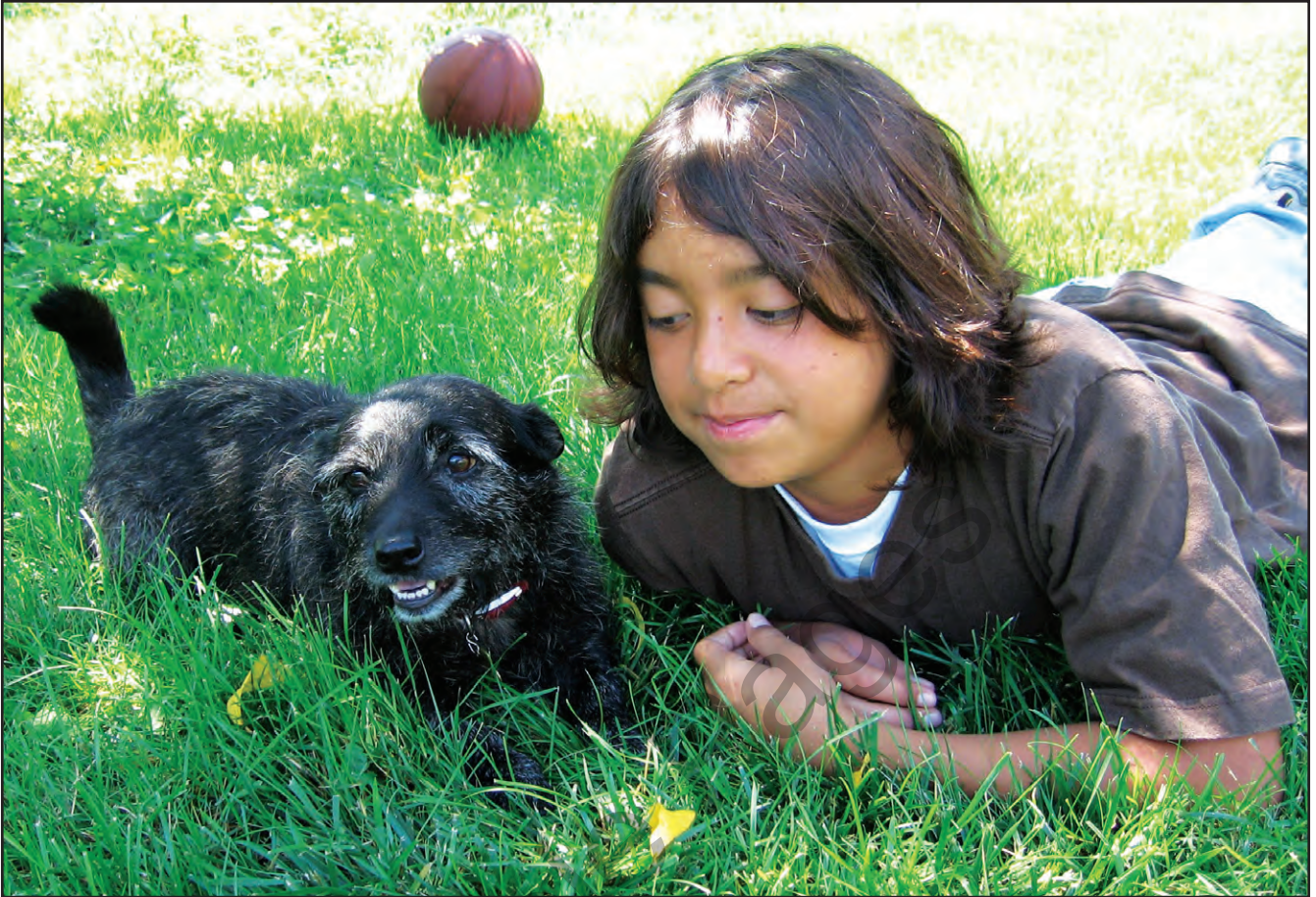
My best friend