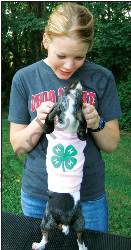
Ohio State University Extension

Youth learn critical-thinking skills through training opportunities in dog care, agility, obedience, showmanship, assistance dogs, and