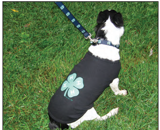
Ohio State University Extension

Land-grant universities throughout the nation provide educational opportunities in subject areas, working effectively with youth and leading positive youth development programs. Extension professionals and other university faculty and staff teach volunteers the many skills and abilities needed to work effectively with youth through educational workshops, clinics, and conferences.