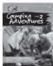
Level 2 BU-08044