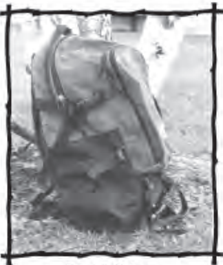
Day hiking back pack.

Pack the items you selected in the previous activity into your backpack or bag. Draw on the outline of the backpack where you packed each of the essential and possibly helpful items. When you have everything you want to take on your day hike walk around your yard or neighborhood, go up and down stairs or a steep slope to see how comfortable your backpack is. Finally practice adjusting each part of your backpack so it best fits your body and your hiking needs.