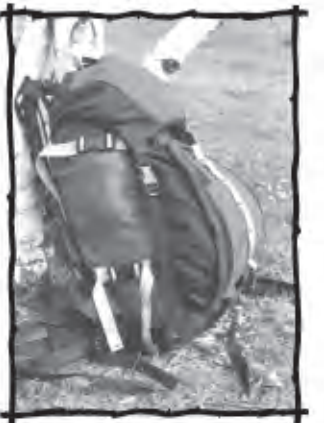
Extended day hike back pack (1-2 day overnight)