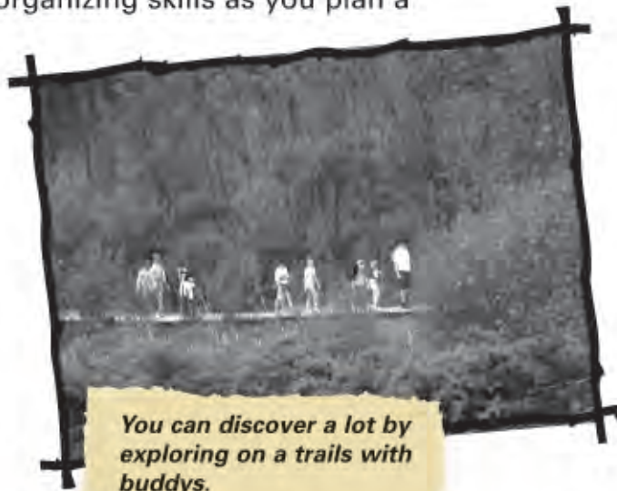
You can discover a lot by exploring on a trails with buddies.

Here is your chance to plan your own day hike. First choose an area you have always wanted to explore. Then answer the questions included in the Day Hike Planning Checklist. The information in Outdoor Tips will help you complete the checklist.