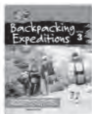
Level 3 BU-08045